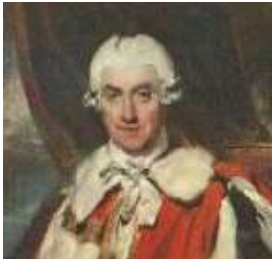
Detail from Portrait of Thomas Thynne, 3 rd Viscount Weymouth (Later 1 st Marquess of Bath), 1795, by Thomas Lawrence