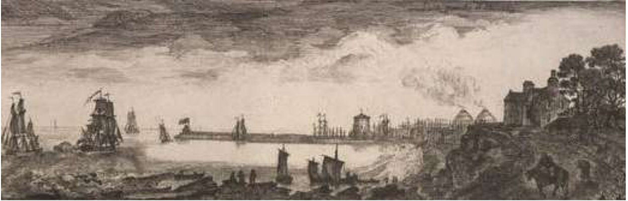
"Leith from the west," circa 1773-1782, by John Clerk

Picture Source: King George III's Personal Coloured Views Collection , British Lib., London