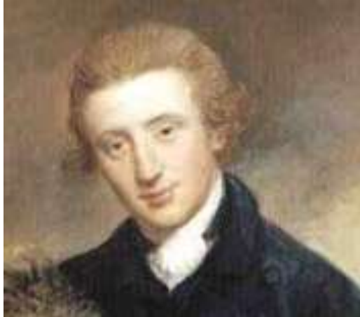
Detail of Portrait of Henry Scott, 3 rd Duke of Buccleugh, 1760, by Thomas Gainsborough