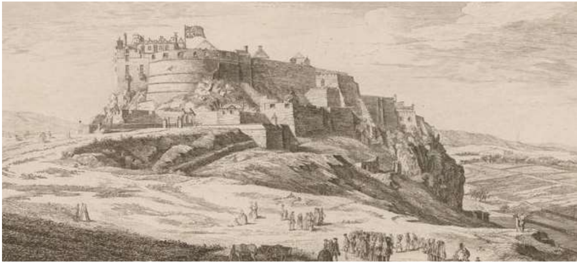
Detail from "East View of Edinburgh Castle," 1753, by Paul Sandby