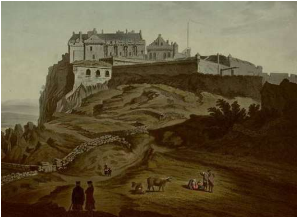
Detail from "South View of Stirling Castle," 1792, by Francis Jukes

Excerpt from Kilts & Courage, Vol. III, The Documentary History of the 42 nd or Royal Highland Regiment in the American War for Independence, 1776-1783 by Paul Pace June 2019 © all right reserved